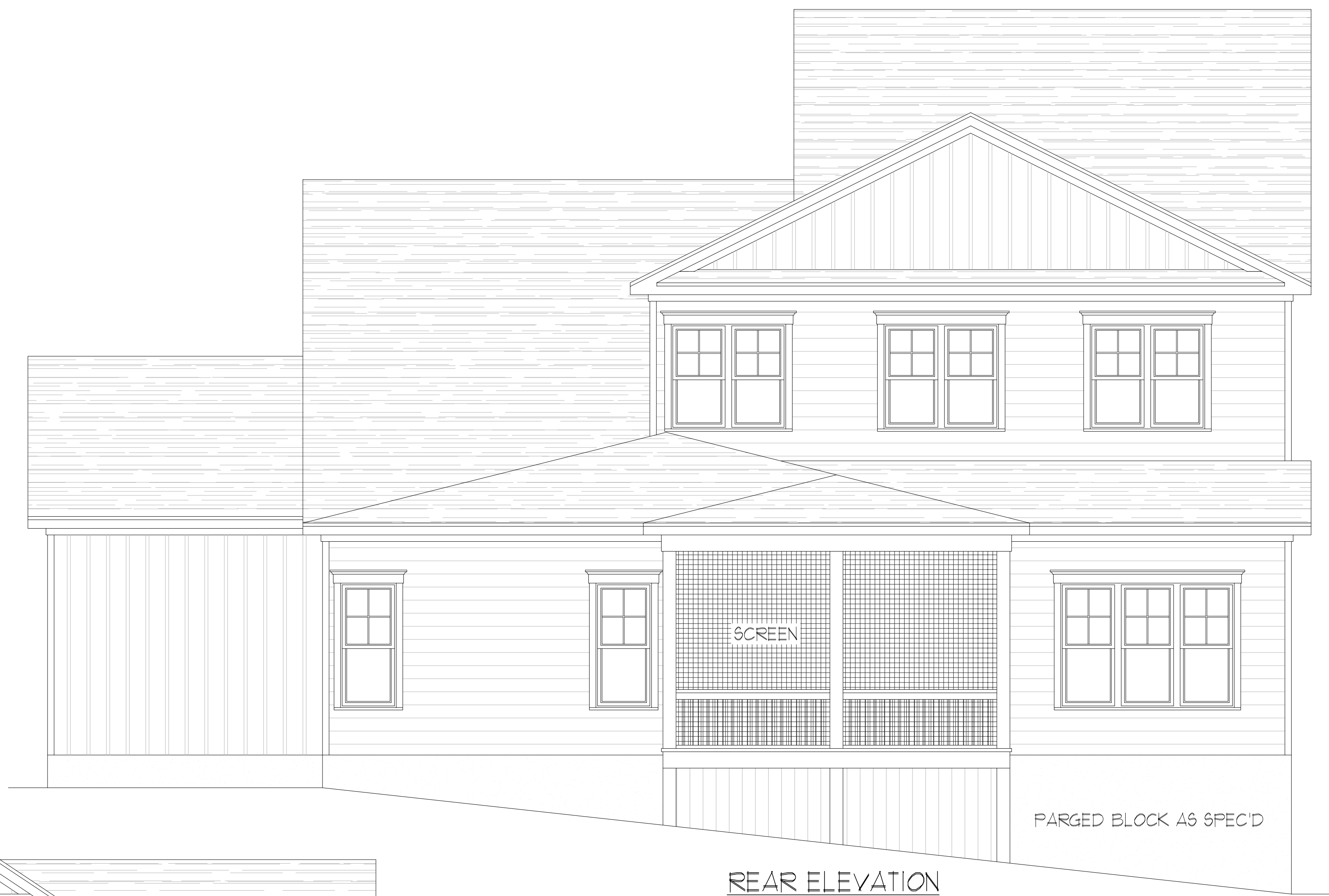
REAR ELEVATION SCALE: ----- 1/4" = 1'-0"